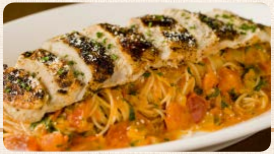
SPICY HERB FRIED CHICKEN