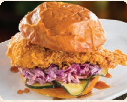
SPICY CHICKEN SANDWICH