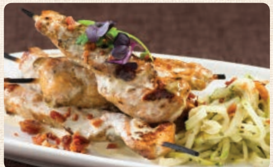
GRILLED CHICKEN SKEWERS