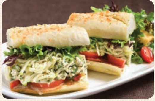
CHIMICHURRI CHICKEN SALAD SANDWICH