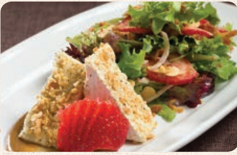
BRIE, STRAWBERRY AND ALMOND SALAD